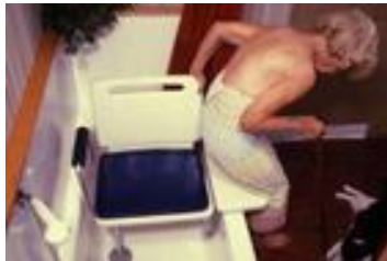
"exercise in embarrassment"

http://www.mcknights.com/Rough-waters-rethinking-bathing-in-long-term-care/article/118501/