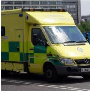
"seven new ambulances"

http://www.alertnet.org/thenews/fromthefield/irishredcr/160d727b29399a140a1bc0e55d867a16.htm