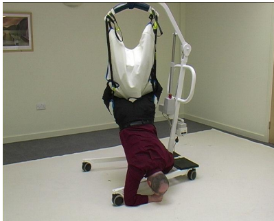
"The Australian Lift"

We have chosen our five winners for last issues caption competition. Each of them will receive one copy of TLC's Assisting People 2006 DVD ( originally sold for £117.50 ).